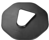
Cover Sleeve-LP Item No. 22801