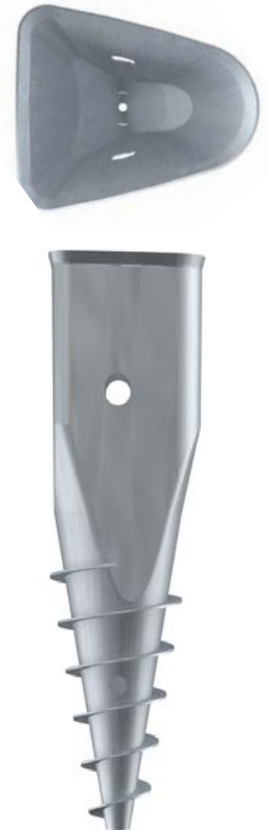
KSF X 135x480-LPS