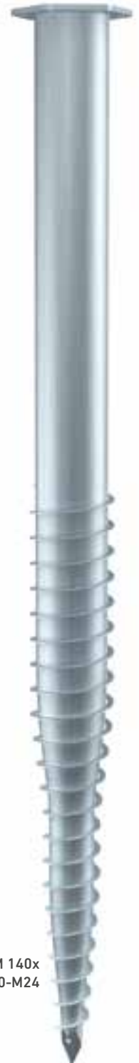
KSF M 140x 2100-M24