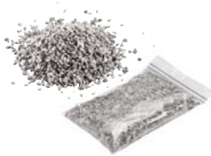
Special Granulate 500 g Item No. 21823