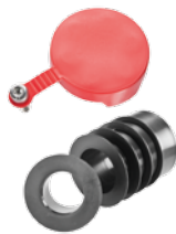
Reduction Sleeve Set-G66 0.10 kg Item No. 21806