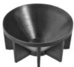
Twisting Element-G 66 0.10 kg Item No. 21839