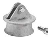
Pivot Linkage Cover-G66 0.30 kg Item No. 21804